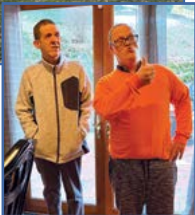
The guys give the new house a big “Thumbs Up!”