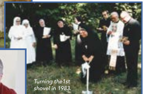
Turning the 1st shovel in 1983.